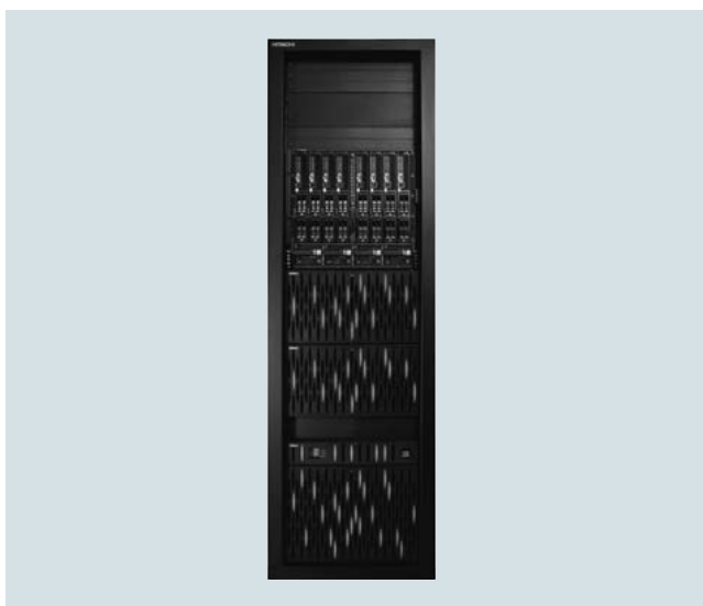
Fig. 1 | Unified Compute Platform Management Rack

The UCP management rack is used to integrate and orchestrate VM templates and deployments.