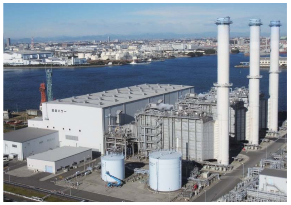
1 Panoramic view of the Ohgishima Power Station