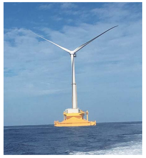
4 5 MW down-wind floating wind turbine

Floating Offshore Wind Farm Demonstration Project funded by the Ministry of Economy, Trade and Industry is scheduled to begin commercial operation in April.