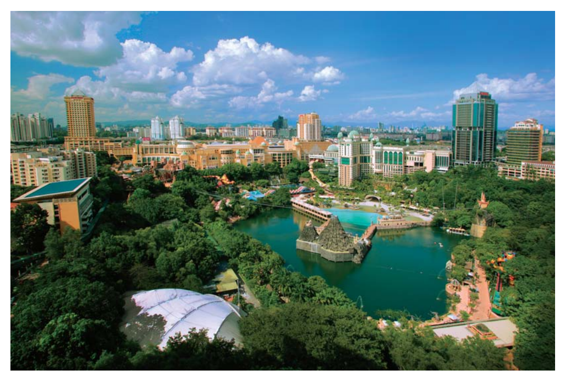
Sunway City, Malaysia's first fully integrated green township as certified by Green Building Index, Malaysia's industry recognized green rating tool for buildings

involved gathering and analyzing a wide range of data, and then applied the study findings to help reduce energy consumption. As a next step, with regard to improving air-conditioning system efficiency, Hitachi concluded a profit sharing, energy-saving guarantee service agreement for educational facilities, and is now