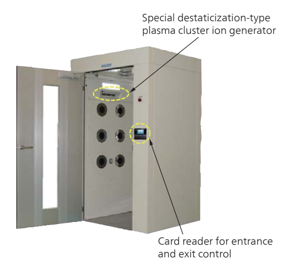
Air shower equipped with special static removal-type plasma cluster ion generator and entry/exit controller

the flutter jet nozzle, a distinct feature of Hitachi air showers.