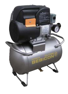
3 Super oil-free compact compressor series (output 200 W)