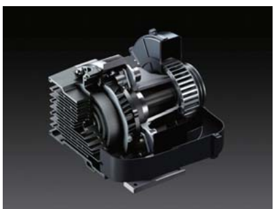
9 New 30 kW oil-free scroll compressor (top) and cut model (bottom)