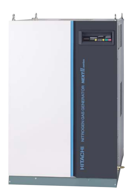
NPO-3.7/5.5 nitrogen gas generator equipped with inverterbased energy-saving control

Nitrogen gas is used to preserve the quality of food, and to prevent oxidization or explosion in the electronic and chemical fields, and is typically supplied in the form of