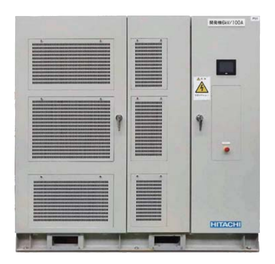
4 World's smallest class of medium-voltage VFD

Generally speaking, VFD control has a short history, and the use of VFD control in medium-voltage electric motors that require high levels of reliability has been limited. In recent years, however, the introduction of VFDs for air blowers at cement plants and steel works has become the industry standard, and demand for VFDs at other plants has also grown. On the other hand, as some customers have found it difficult to introduce VFDs due to space constraints at existing plants, Hitachi took the step of developing a VFD that is one of the smallest in the world* by adopting an all-in-one