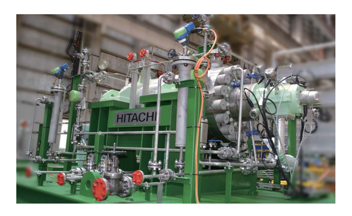
1 Medium-capacity injection pump