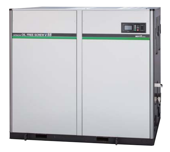
8 Oil-free screw compressor (55 kW water cooled type, two-stage compressor)