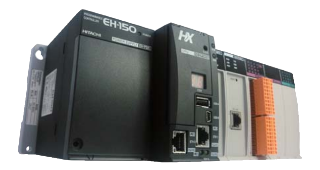
Example of HX series configuration combined with I/O module

(Hitachi Industrial Equipment Systems Co., Ltd.)