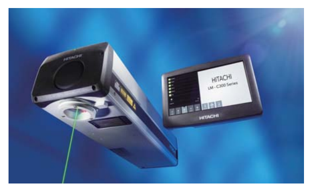
™ New CO₂ laser marker with highly-advanced marking technologies (horizontal type)