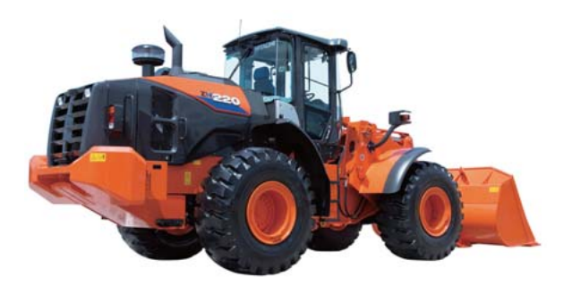
3 ZW220-6 wheel loader

(1) A ride control system and a lift arm smooth stop mechanism that helps relieve operator fatigue provided as standard.