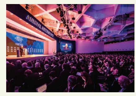
Congress Hall (main hall)