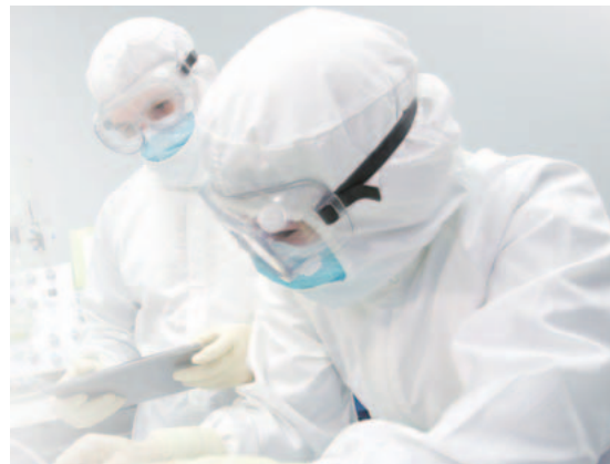
3 Working in a cleanroom

Beginning in March 2016, Hitachi Chemical Company, Ltd. formed a partnership with PCT [PCT, LLC, a Caladrius Company (currently