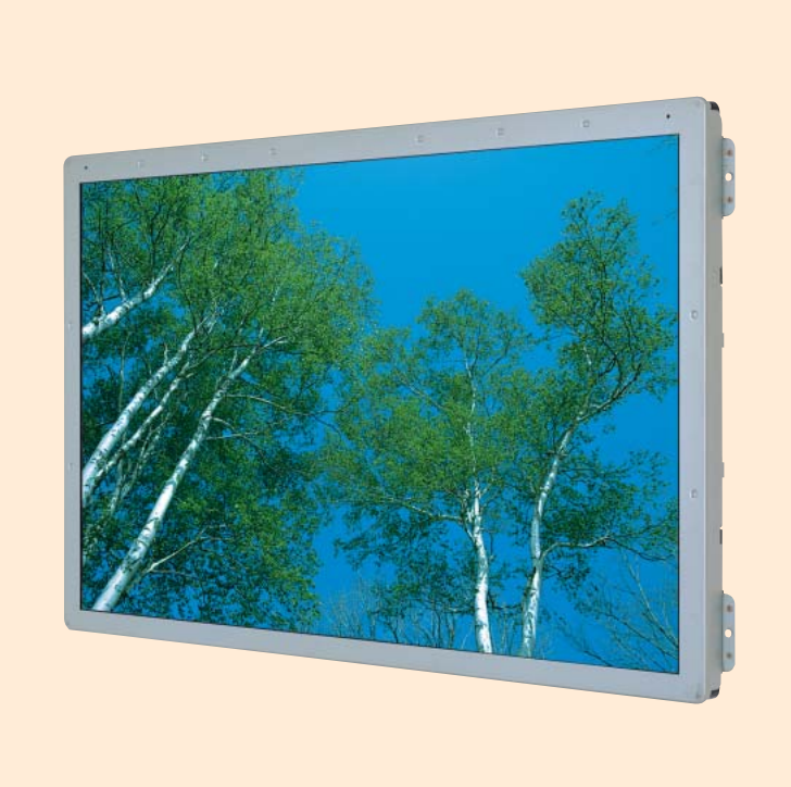
External view of 80-cm (32-inch) WXGA TFT-LCD module

To meet the demands of the flat TV market for larger size and higher performance, Hitachi has developed 80-cm (32-inch) WXGA* (wide-extended graphic array) TFT-LCD (thin film transistor liquid crystal display) module adopting AS-IPS (advanced super in-plane switching) technology.