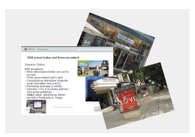
Fig. 7—Field Search, Man-machine Interfaces in Public Space. Hitachi Europe Ltd. has been selling FPDs (flat panel displays) into public areas, like shops, markets etc., but hadn't pursued the potential for interactivity as added value.