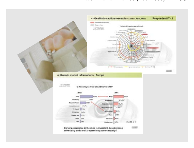
Fig. 3—Documents of Colour Material and Finish Benchmark and Market Research.

To analyse the original brief in order to optimise the product requires an interdisciplinary review process between engineers, marketing and industrial designers. Ergonomics, technical specifications, services,