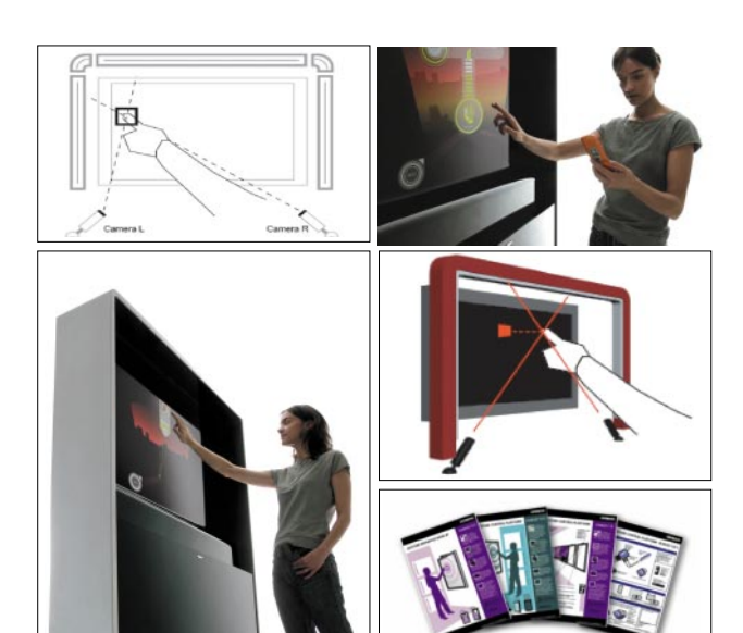
Fig. 11—Working Prototype and Real Working Interface for Gesture—and BT Mobile Phone Screen Interaction. Realised in 2004.

A Working prototype realized by customized technologies will close the circle of experience in a presentation.