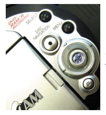
Fig. 4—Joystick as Navigation Interface Applied for DVD Camera for First Time. Designers found it useful to express the simplicity of the disk navigation and new editing features of DVD technology.

Benchmarking is the analysis and expression for understanding differences between local markets.