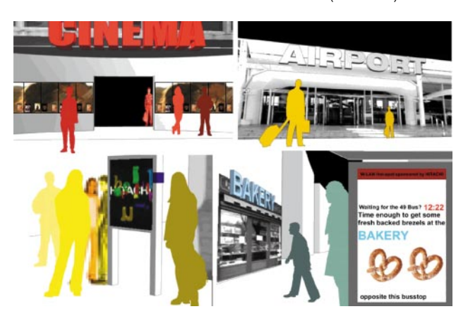
Fig. 9—Macro Scenario Settings, Gesture Interaction at Cinema, Airport, etc. Flash Based Scenario Animation. Designers added information on potential stakeholder companies behind that scenario and same for potential content providers.

Hitachi Europe at that time has been selling FPDs (flat panel displays) into public areas, like shops, markets, etc., but hadn't pursued the potential for interactivity as added value. Inspired by that trend, Design team in Europe started to investigate manmachine interactions in public spaces (see Fig. 7). The impact of digital technologies on media consumption in the EU states, as well as the high uncertainties of media access in public space, have urged to make a comprehensive SWOT (strength, weakness, opportunities, threats) analysis. The team was able to gain valuable insights from our network of trend scouts as well from our Internet based research. In Japan we realised that people experience a different sociocultural as well as technical-context when it comes to public media consumption. Back in Europe, we had to adjust our ideas to the actual 2.5 G (generation)