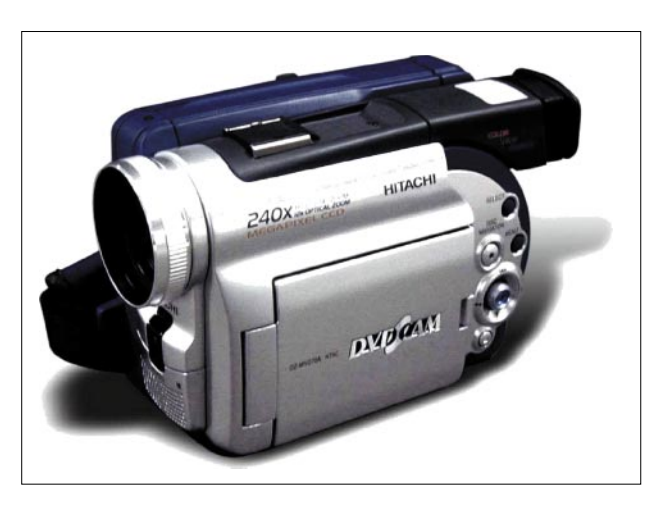
Fig. 1—DVD Camera 2nd Generation. New DVD format has a broad impact on the overall camera design due to the new functionality and form factor.

Design has its roots around 1870. Influenced by the arts and crafts movements in U.K., the Vienna