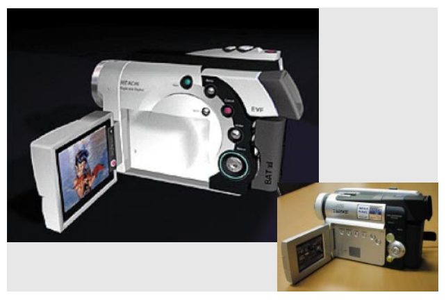
Fig. 6—Virtual 3D Rendering and Animation on PC. Real 3D Model for Final Evaluation.

Designers will deliver 3D technical drawing to the engineering department for physical 3D models realization to be applied for engineering moulds in various materials.