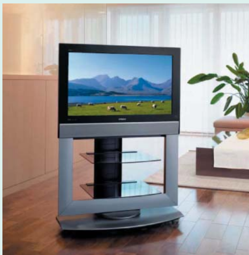
32-inch LCD TV