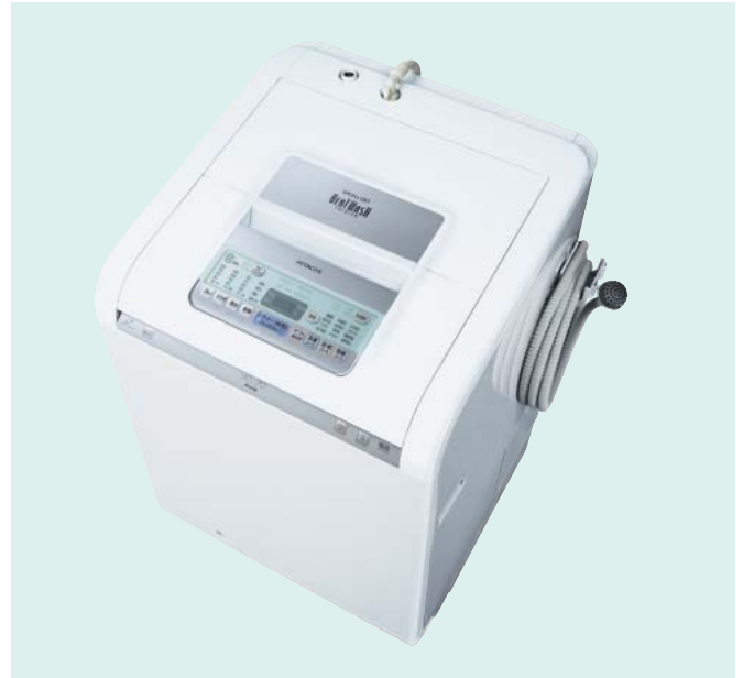
Combination washer-dryer model BW-DV9F

* Compared to Hitachi's 1996 model NW-8S2 washer-dryer, and assuming a standard wash-dry cycle and 9-kg load.