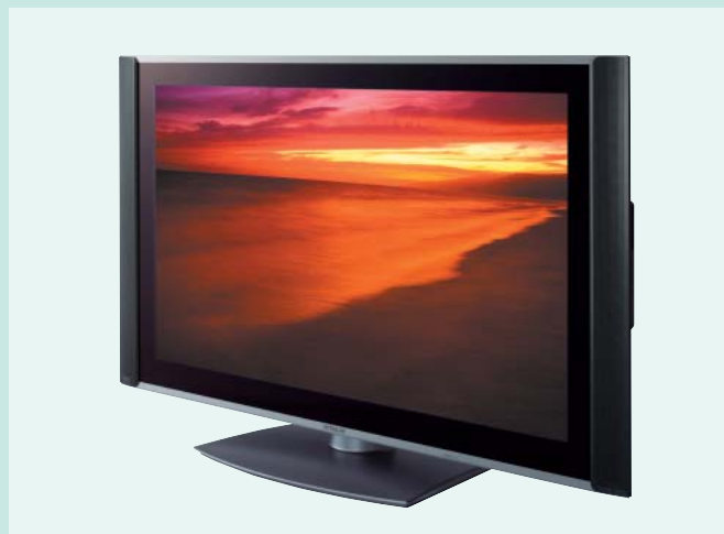
Hitachi plasma television 9000 series

Our next challenge is to commercialize products equipped with a “full Hi-Vision(1,920 × 1,080 pixels)” panel for which Hitachi has presented technical specifications, thus allowing users to enjoy even more beautiful images. We will also market our products worldwide by offering Hitachi-led HDD-equipped TVs to the whole world. We will thus make sure that more people enjoy television in the way it ought to be enjoyed, that is, “watching television any time you like, any program you like, and with beautiful images.”