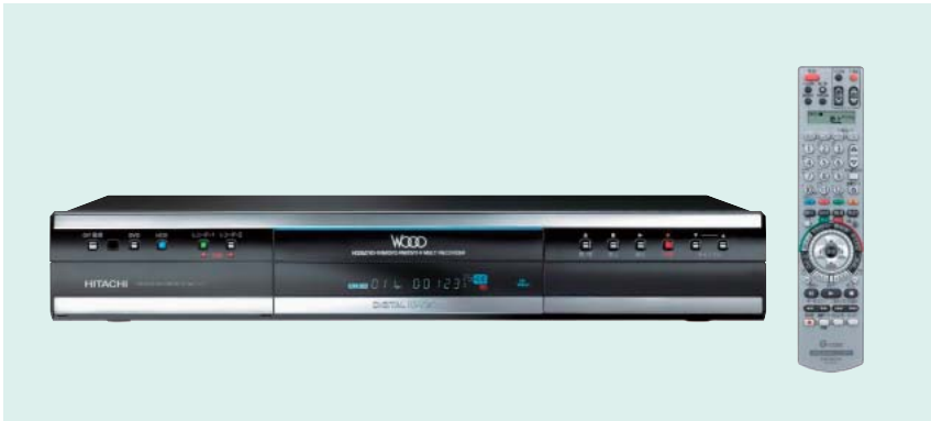
Digital Hi-Vision recorder: DV-DH1000W

Recorded programs are automatically sorted by name, genre, etc. A user can easily find the program to watch by simply pressing the button.