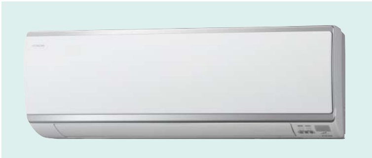
Room air conditioner equipped with the industry's first pollen elimination mode