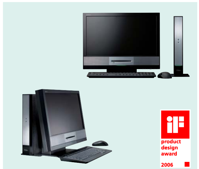
Trim-profile and stylishly home server PC DH75P and DH73P in black

(8) Supports quick and easy connectivity to Internet content sites by remote control.