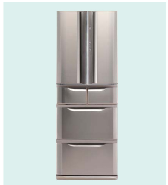
Twin door refrigerator