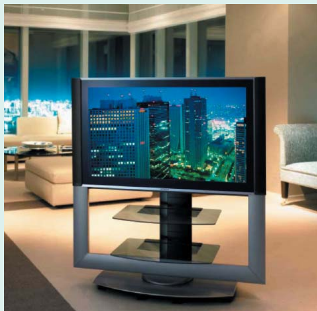
42-inch PDP TV

Hitachi's flat-panel HDTVs : LCD and PDP models for Japanese market