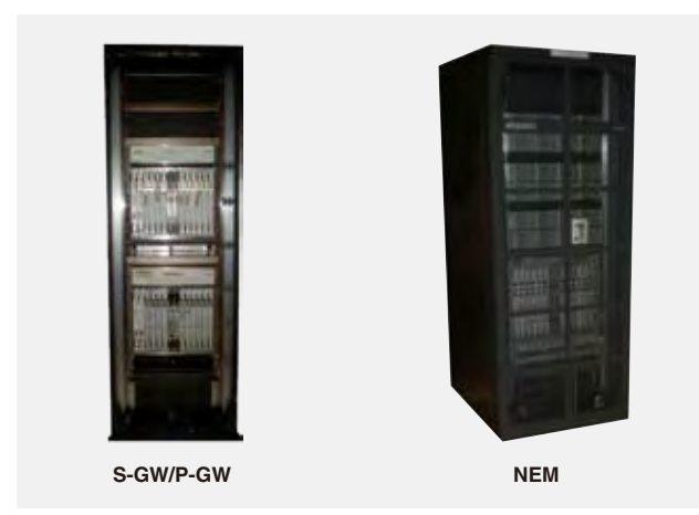
Fig. 4—ER5000 Series LTE Products. Core network equipment is shown.

Hitachi is also working on initiatives that include ensuring the continuity of billing and authentication techniques and high-speed handover between LTE and eHRPD systems.