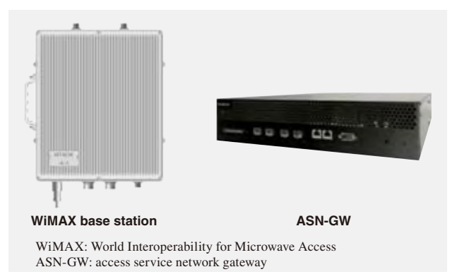
Fig. 1—ER3000 Series WiMAX Products. A WiMAX base station and ASN-GW are shown.

Fig. 2 shows an overview of a Mobile WiMAX system. The Mobile WiMAX system uses base stations and an ASN-GW (access service network gateway) to manage the wireless operation, location, and movement