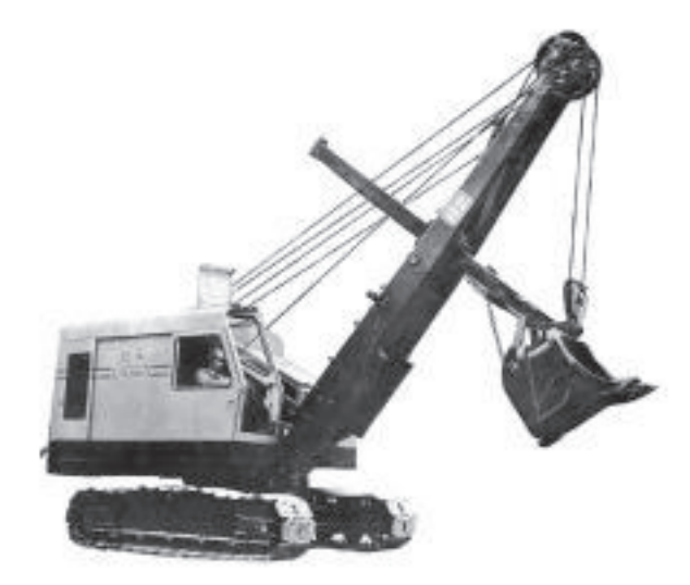
Fig. 3—Mechanical Excavator.

Prior to the arrival of hydraulic excavators, most digging and loading work was done by mechanical