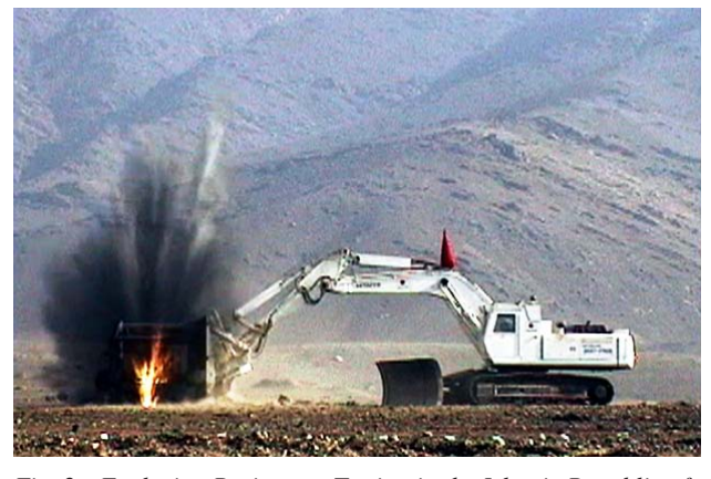
Fig. 2—Explosion Resistance Testing in the Islamic Republic of Afghanistan. Stringent explosion resistance testing is conducted, with the

safety of the operator having top priority.