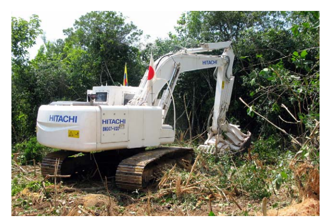
Fig. 1—Swing Type Anti-personnel Landmine Removal Machine Able to Deal with Brush Efficiently Using Rotary Cutter. The rotary cutter is used to clear the brush to make the landmines easier to find. The unit can swing backwards and forwards to follow the lie of the land and perform clearance work even on sloped or other uneven terrain.

Rotary cutter machines are one solution to this problem. The cutters rotate at high speed to pull out brush by its roots, and these same cutters can be used to explode any mines in the soil. An advantage of swing type machines based on hydraulic excavators is that they can cope with the different terrains in which landmines are buried. In addition to the hill-climbing capabilities of a hydraulic excavator, the end of the arm can follow the topography in situations such as steep or rugged terrain with severe undulations. The machine can also be used for digging by changing the attachment at the end of the arm to a bucket, for