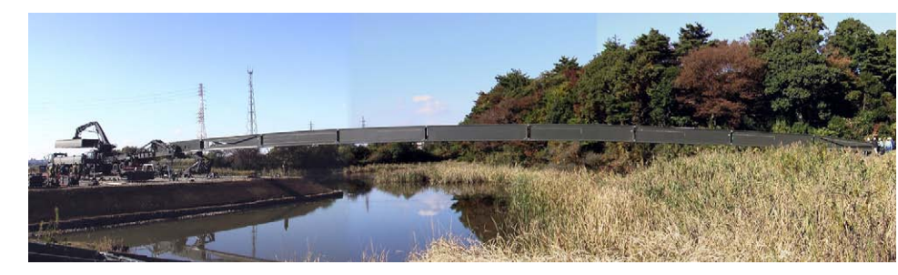
Fig. 4—Guide Beams during Deployment Process. The guide beams have a welded structure of high-strength aluminum.