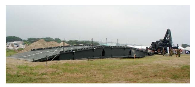
Fig. 7— Type 07 Mobility Support Bridge in Deployed Configuration.

The photograph shows the civilian Type 07 mobility support bridge deployed as part of the FY2010 general civil defense drill of Kitaibaraki City in Ibaraki Prefecture. The vehicle in the rear is the construction vehicle.