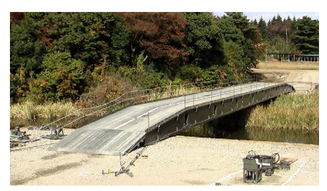
Fig. 5— Completed Bridge. The bridge sections have sufficient strength to carry heavy vehicles.

Like the floating bridge, the span bridge must also be made small and light, taking account of factors such as vehicle width, height, and gross weight to ensure that the vehicles can drive on standard Japanese