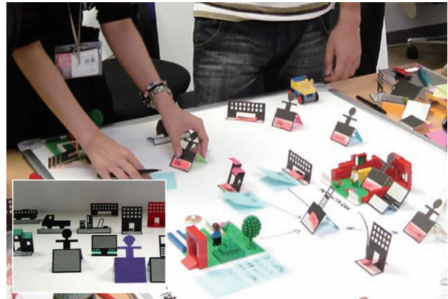
Fig. 3—Using Business Origami.

Project members use origami models of people and buildings as props for holding active discussions with the aim of constructing a customer-centered value chain.