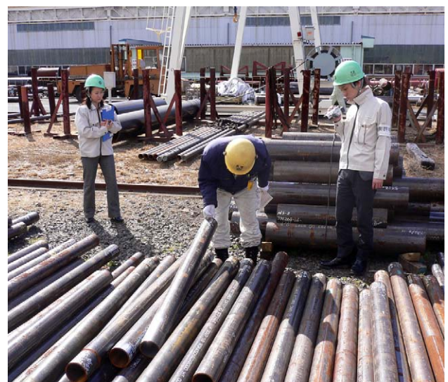
Fig. 1—Conducting Ethnographic Research. The people on the right and left are researchers who are observing and recording the behavior of the worker in the center.

Fig. 2 shows an experience table generated for a project that was developing a system for over-the-counter banking services. The horizontal axis represents time and the sequence of phases. The upper half of the table depicts the flow of bank staff experiences, and the lower half depicts the flow of customer experiences. In each phase, the customer wishes to accomplish a different task. Arriving at the bank, the customer may only want to obtain some information, but having expressed this request they may subsequently want to know more in order to resolve some uncertainty. Likewise, the value that the bank staff should provide to the customer varies from phase to phase. Welcoming a customer who visited the bank, the staff aims to relieve any