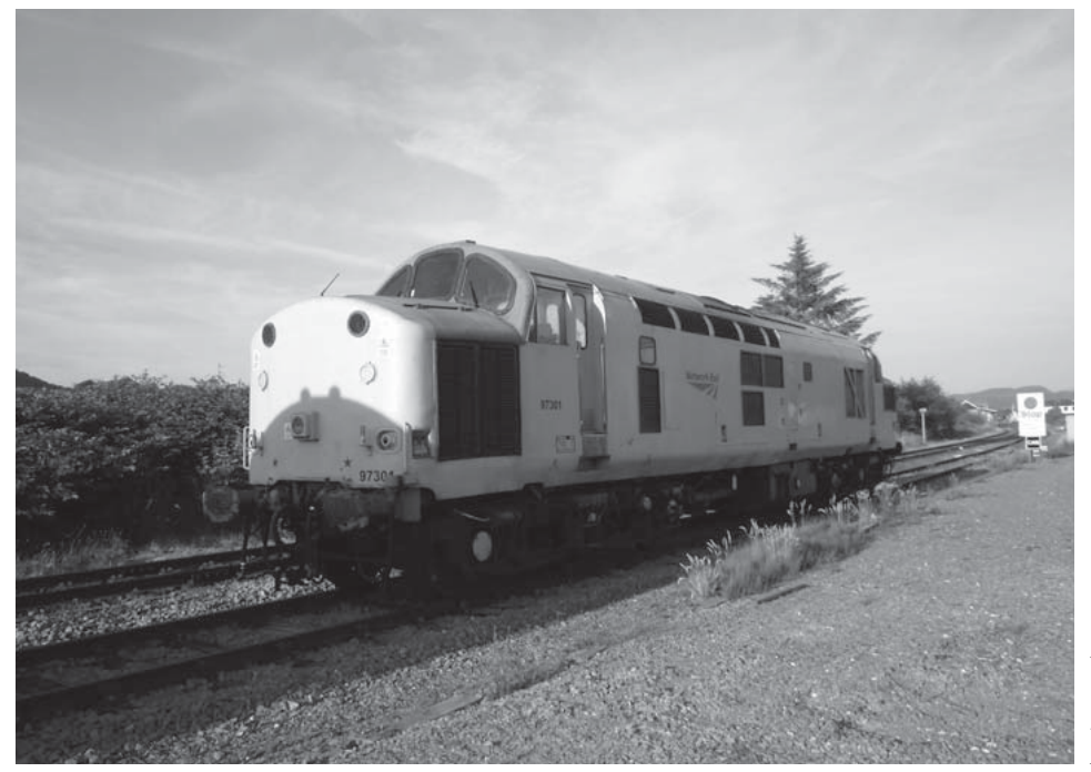
Fig. 4—Class 97 Locomotive This shows the Class 97301 diesel locomotive at Porthmadog.

trial ETCS on-board equipment in the UK. During this project, a Class 97 locomotive (97301) was successfully retro-fitted with Hitachi's on-board system to prove interoperability with other systems currently in use. As part of this recent success, the Hitachi system was correctly identified by the Network Rail Signalling System and Control Centre in Wales (Machynlleth) without any system failures. The locomotive was driven under its own power using ETCS Level 2 and communicating via the GSM-R radio network in various operational modes. The trial was completed in September 2013, running more than 1,200 km without any major failures (See Fig. 4).