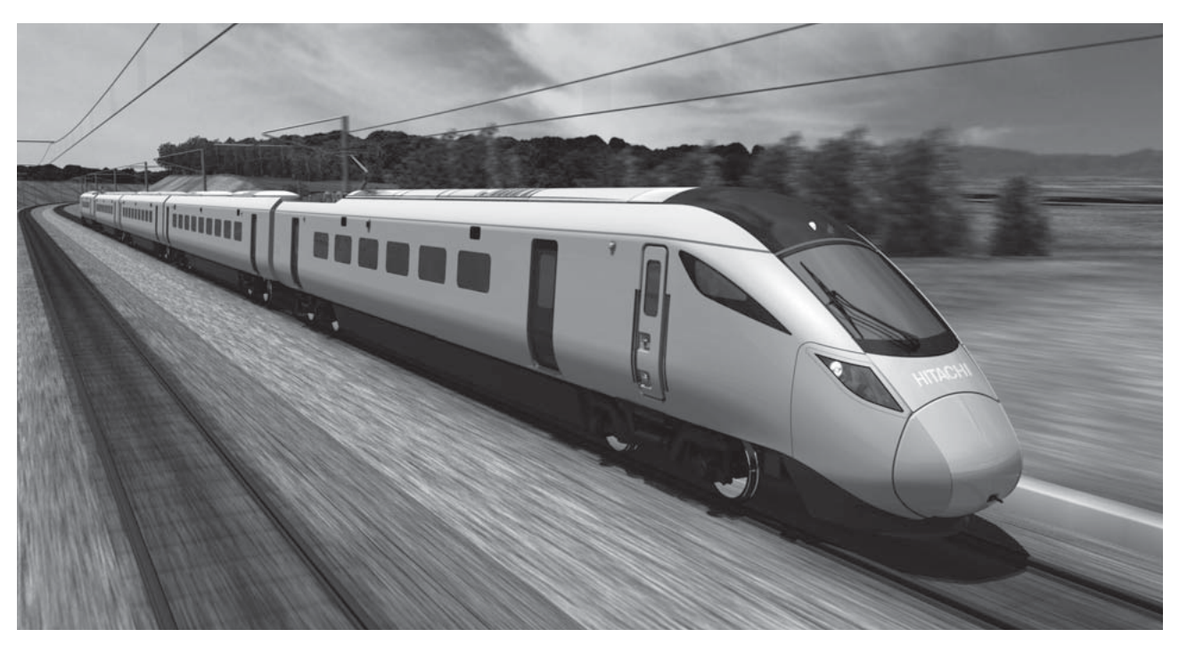
Fig. 1—IEP rolling stock This is a computer graphic of Hitachi's IEP rolling stock for the UK

reliability figures, the biggest rolling stock contract in UK railway history has been awarded to Hitachi; known as the Intercity Express Programme (IEP), including rolling stock delivery as well as maintenance (see Fig. 1). These achievements drive Hitachi's growth in transportation systems on a global scale.