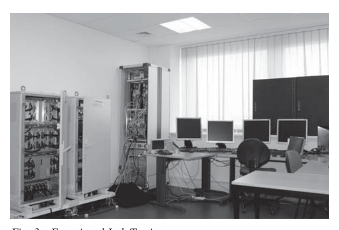
Fig. 3—Functional Lab Testing This shows the interoperability testing environment at Multitel (European Reference Laboratory).

Following the completion of TSI compliant testing, the Hitachi on-board ETCS solution has successfully connected to the Network Rail Cambrian Line signalling system and achieved ETCS Level 2 operation. This achievement came as part of Hitachi Rail Europe's 'Verification-Train 3' project to