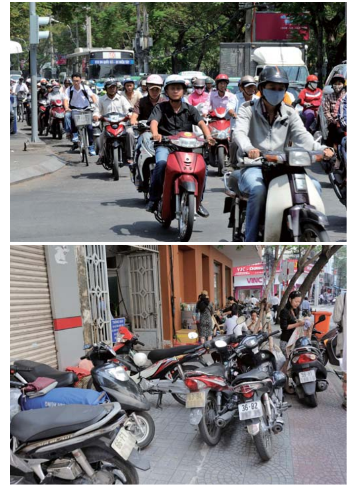
Motorbikes are a vital means of transportation for the residents of Ho Chi Minh City.

The underground section of Ho Chi Minh City Urban Railway Line 1 runs from Ben Thanh to the Opera House and Ba Son stations. The overground section runs through major districts along a main highway, including suburban residential areas, industrial precincts, and a theme park at Suoi Tien, terminating after a total distance of 19.7 km at Suoi Tien.