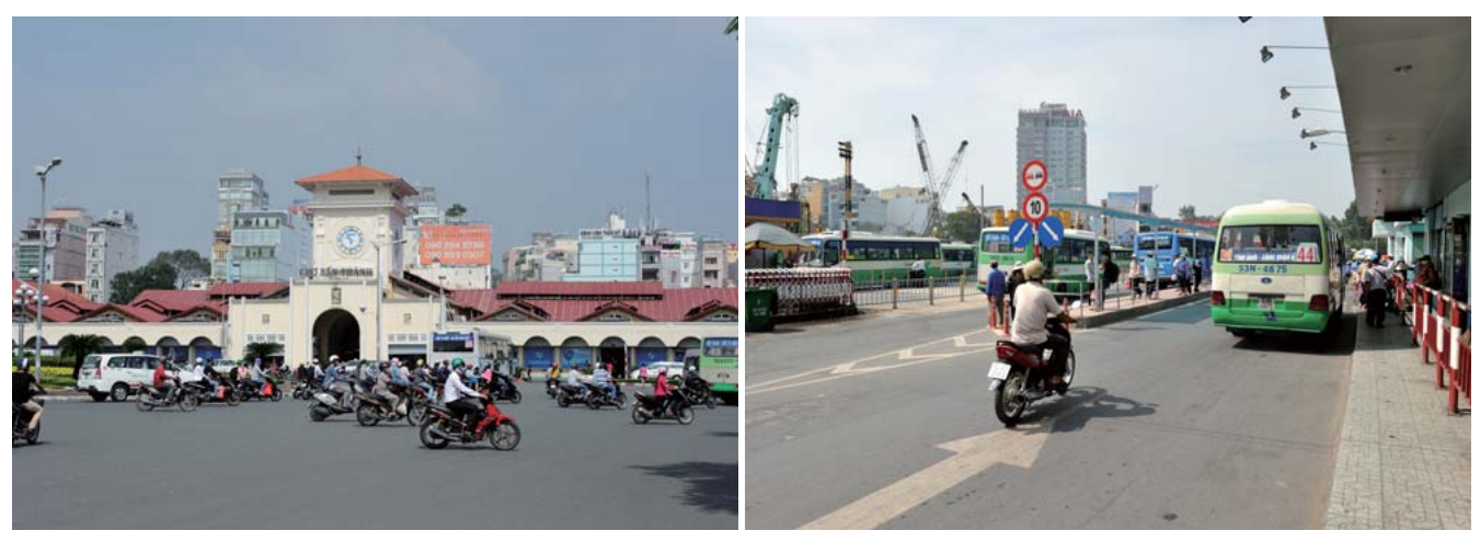
Ben Thanh, home to the city' s largest market, and adjacent bus terminal. The new metro station will be constructed at this site.