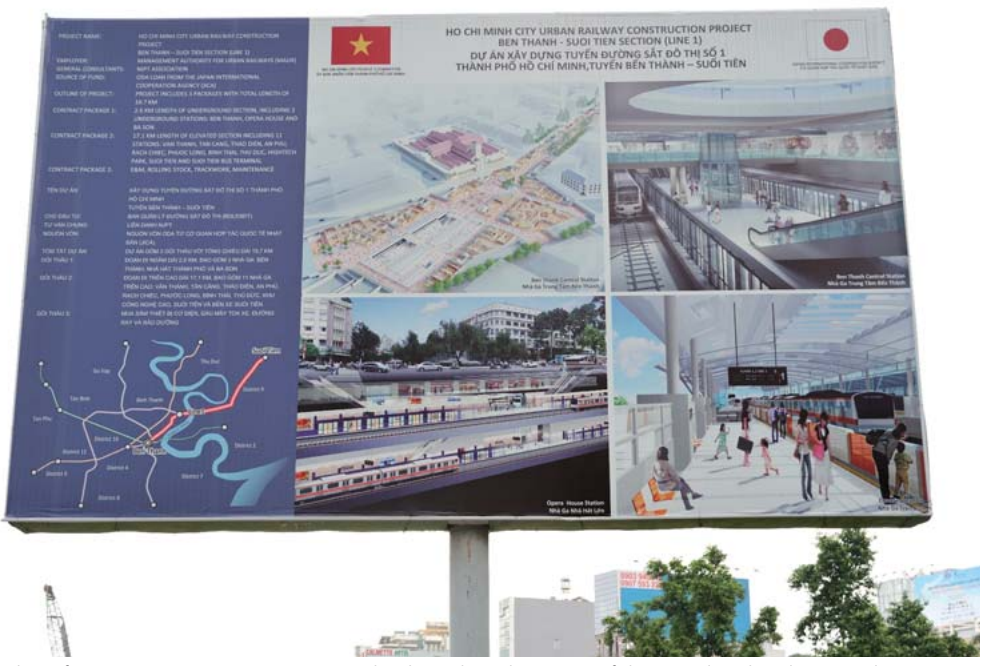
Planned site for station construction near Ben Thanh market. The image of the completed underground station is inspiring the expectations of city residents.

Just as the flow of blood supplies animals' bodies with nutrients, the free movement of people brings dynamism to a city. Railways and other transportation systems act as a city's arteries. Clearly, Ho Chi Minh City Line 1 will not only provide residents with a safe and convenient means of transportation, it will also provide the foundations for the city's further development.