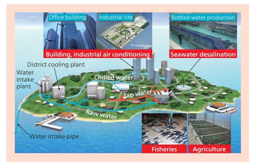
A plan is underway in the Maldives to use deep seawater first to produce chilled water for air conditioning, and then for a series of other uses.