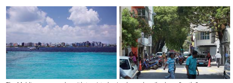
The Maldives are popular with tourists, having been described as a South Seas paradise. Hitachi took a stake in the company that operates the local water supply and sewage systems in 2010 and is involved in its business activities.

Given these circumstances, Hitachi has sketched out a blueprint for utilizing cold energy extracted