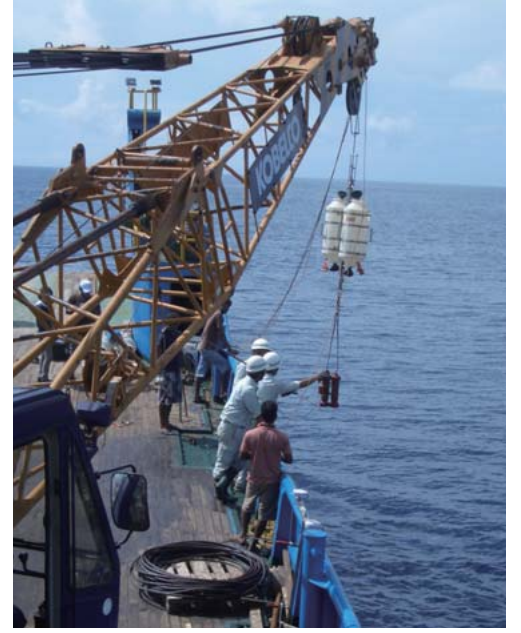
A bathymetric survey is being conducted in the Maldives in preparation for the use of deep seawater.

"We have estimated that, depending on the conditions, we can reduce the emission of greenhouse gases associated with air conditioning by around 80% compared to conventional systems. The concordance between Hitachi's aim of having the system more widely adopted and the Japanese government's desire to establish a joint