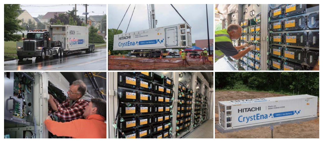
On-site installation at project in New Jersey, USA

Solutions Business Management Division, Hitachi, Ltd.) who is engaged as the project manager for this project, comments: