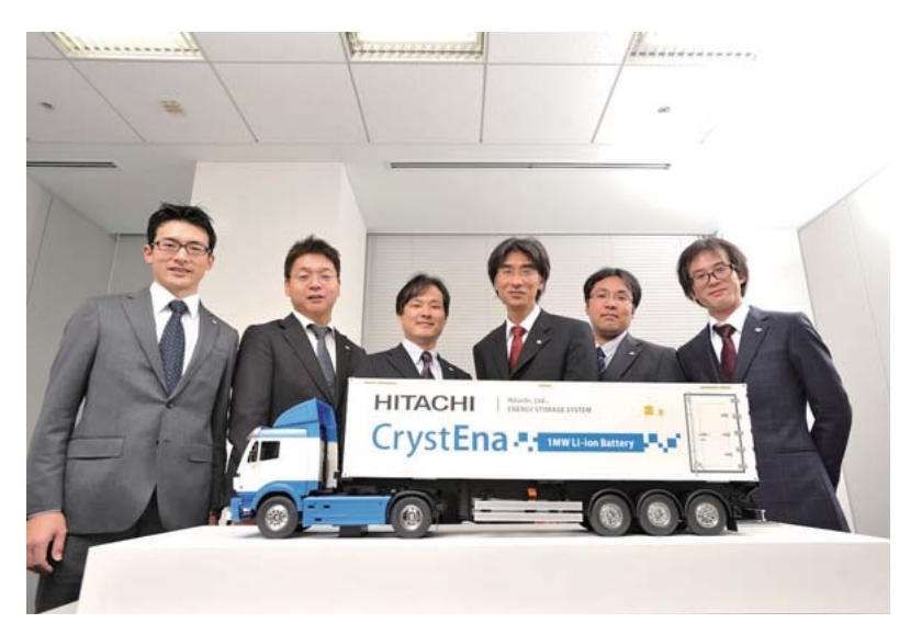
The container-type energy storage system was developed by bringing together knowledge from across Hitachi, including technology for batteries, safety design, and control.